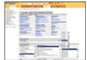
Predefined Idea Screen