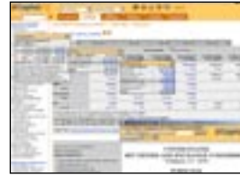
Auditable, Adjusted Financials